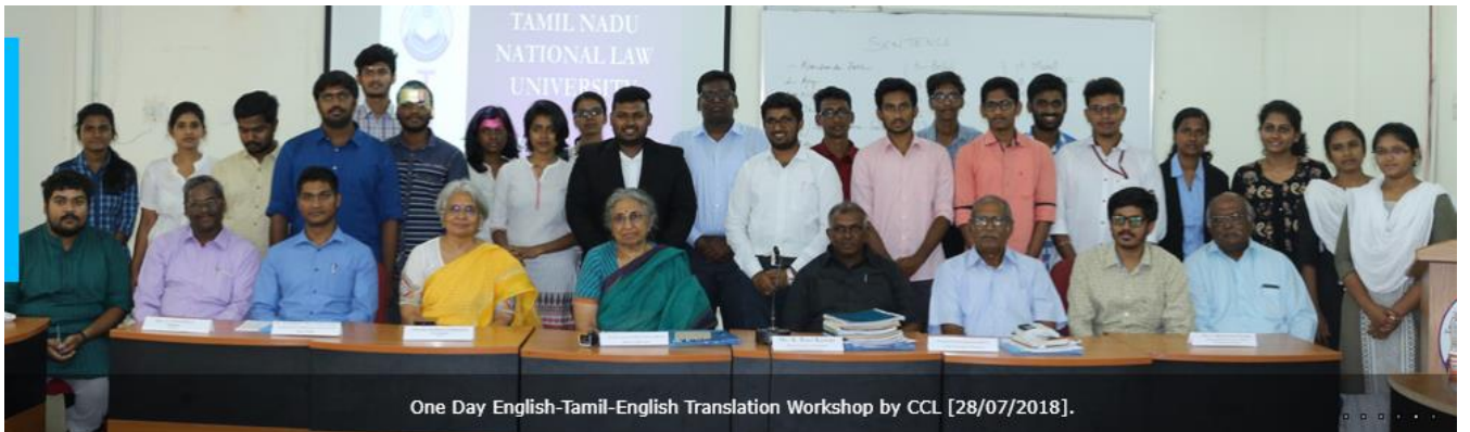
One Day English-Tamil-English Translation Workshop by CCL [28/07/2018].

Organised by the Centre for Competition Law (CCL), TNNLU